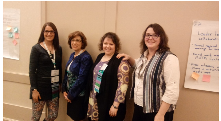
4 New England state presidents working together on a project at ASAP leadership meetings